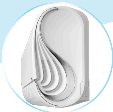
Elegant S-curved design