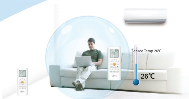
'Follow Me' active