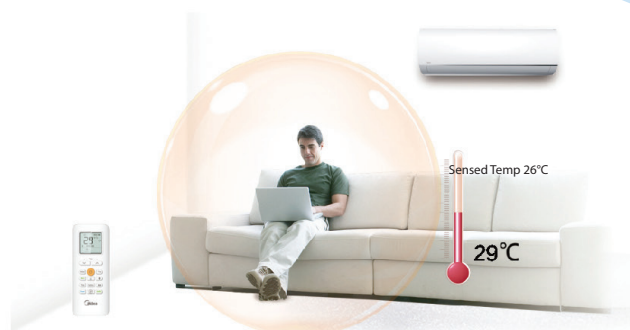
'Follow Me' inactive